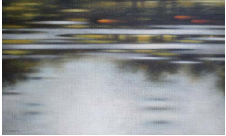
The above acrylic painting will be auctioned at the OLPA Gala. It's called "Sunday by the Fish Pond" by artist Clem Bedwell.