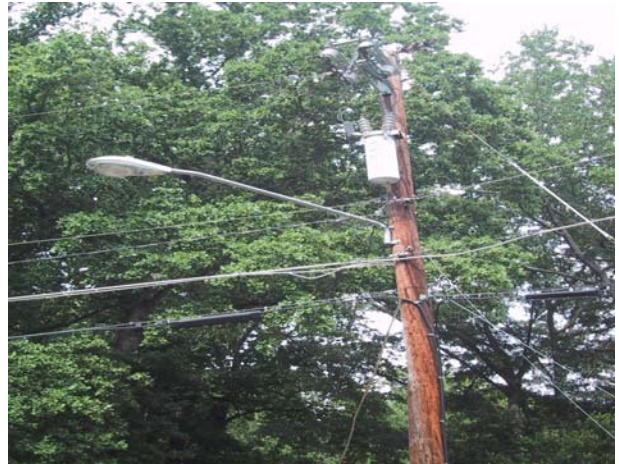
Streetlights will be replaced with the same lighting used in the other park segments.