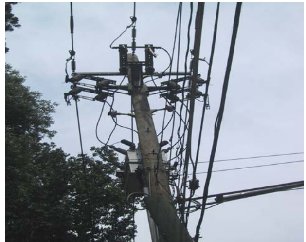
What is it? Only the utility companies know for sure. This massing on the south side of Deepdene is coming down.